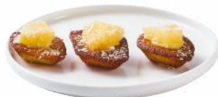
TRADITIONAL PETITS FOURS

Enhance your cocktail with Champagne, White Wine, Red Wine, Rosé, Beers & Soft Drinks