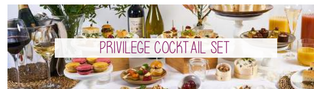
PRIVILEGE COCKTAIL SET

Savoury : Foie Gras Mille-Feuille, Panna Cotta with Peppers, Gourmet Bread Specialties, Savoury Tarts, Morello Salmon Raspberry, Green Détox, Cold Mini Beef Burgers, Navettes & Buns, Mini Wraps, Épicéa (small cold dish) & Méli-Mélo de saison