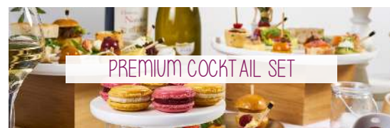
PREMIUM COCKTAIL SET

Savoury : Mini Blinis, Savoury Tarts, Morello Salmon Raspberry, Green Détox, Cold Mini Beef Burgers, Navettes & Buns, Mini Wraps, Fresh Bites & Seasonal Méli-Mélo