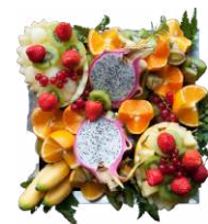
EXOTIC CUT FRUITS "CARIOCA"

Exotic & seasonal fresh cut fruits assortment, ready to taste.