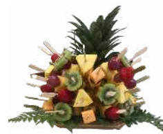
HEDGEHOG ON FRESH FRUITS