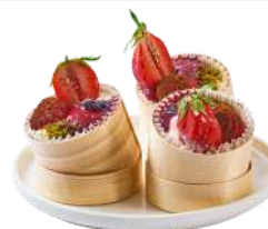
GOURMET SWEET VERRINES