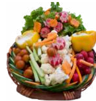
THE BASKETS OF RAW VEGETABLES

Cherry tomatoes, white radishes, cucumbers, cauliflower, carrots & peppers