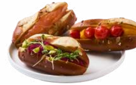
MINI BRETZEL BREADS