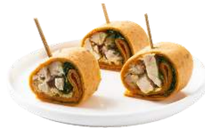
ASSORTMENT OF MINI WRAPS