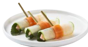
MINI REVISITED SPRING ROLLS