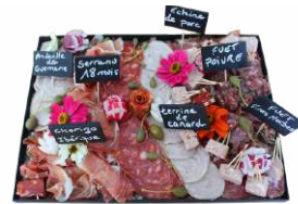
DELI MEATS TRAY

Méli-Mélo : Chorizo • Dried beef • Rosette • Fuet • Dry sausage,... With french bread, butter, gherkins & onions