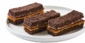
FINGER MINI SANDWICHES

Sandwich bread, Mimolette & Pastrami beef