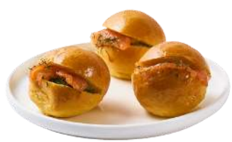
NAVETTES & BUNS