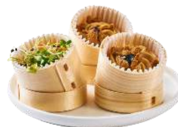
GOURMET MINI VERRINES