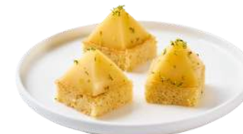
BRETON SPONGE CAKE