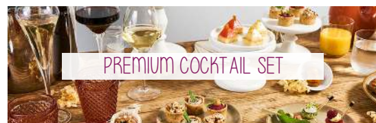
PREMIUM COCKTAIL SET

Savoury : Cold Mini Beef Burgers, Navettes & Buns, Mini Bretzel Breads, Fresh Bites, Savoury Tartlets, Foie Gras Mille-Feuille, Morello Salmon Raspberry, Green Détox & Seasonal Méli-Mélo