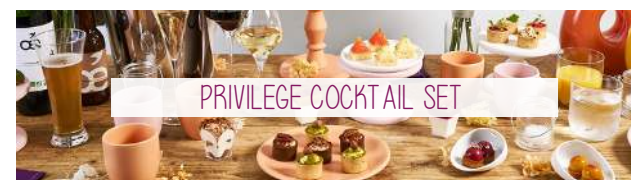
PRIVILEGE COCKTAIL SET

Savoury : Mini Wraps, Fresh Bites, Gourmet Bread Specialties, Mini Blinis, Savoury Tarts, Foie Gras Mille-Feuille, Comté Cheese dices, Morello Salmon Raspberry, Green Détox, Cold Mini Beef Burgers, Navettes & Buns, Épicéa (small cold dish) & Seasonal Méli-Mélo