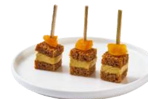
FOIE GRAS MILLE-FEUILLES