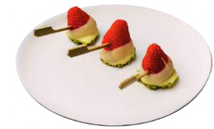
CHOCO PISTACHIO FRUITS SKEWERS