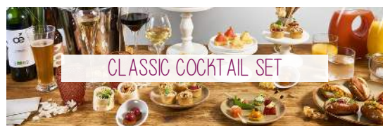
CLASSIC COCKTAIL SET

Savoury : Fresh Bites, Mini Blinis, Gourmet Bread Specialties, Pepper Dome, Cold Mini Beef Burgers & Seasonal Méli-Mélo