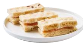
NORDIC FINGER MINI SANDWICHES

Nordic finger polar bread, smoked Salmon or Trout & fresh sheep's cheese with herbs