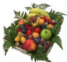
SEASONAL FRESH FRUITS BASKET

Assorted fresh seasonal fruits in a wicker basket