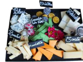
LE PLATEAU DE FROMAGES FRANÇAIS AOC