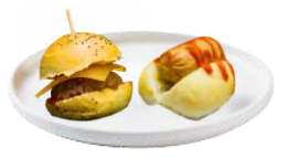
MINI BURGERS & MINI HOT-DOGS (TO REWARM)