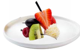
SKEWERS WITH SEASONAL FRESH FRUITS

Five kinds of fruits according to the season.