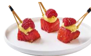
MORELLO SALMON RASPBERRY

Salmon infused with Morello Cherry, mustard cream & fresh Raspberry