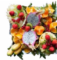
EXOTIC CUT FRUITS "CARIOCA"

Exotic & seasonal fresh cut fruits assortment, ready to taste.