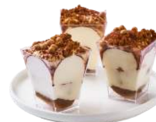
MINI GLASS CUP OF TIRAMISU

Vanilla cream, Coffee-Flavoured Lady finger & Cocoa powder