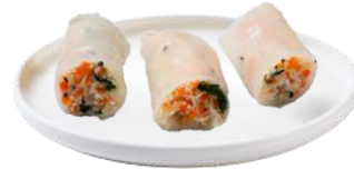
MINI VEGETARIAN SPRING ROLL

Carrot, rice vermicelli, soy, Mint & sesame seed mix wrapped in a rice cake