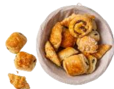
ASSORTMENT OF MINI PASTRIES

Full of vitamins to have a great start of the day !