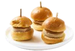
MINI BURGERS (COLD)

Pulled Beef , fried Onions, mustard sprouts & barbecue sauce