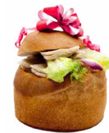
ASSORTED SURPRISE BREAD

50 pieces for the "Monet" 66,00 € 100 pieces for the "Qauguin" 79,50 € 150 pieces for the "Corot" 142,00 €