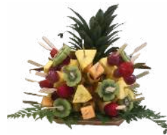
FRESH FRUITS PINEAPPLE