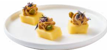
COMTÉ CHEESE DICES