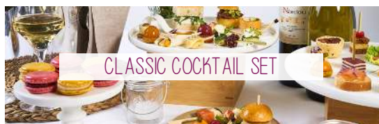
CLASSIC COCKTAIL SET

Savoury : Savoury Tartlets, Morello Salmon Raspberry, Green Detox, Navettes & Buns, Mini Bretzel Breads & Seasonal Méli-Mélo